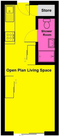
Fleet Court, 25 OLD MILTON STREET,LEICESTER, LE1 3BB