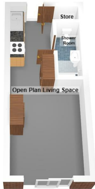
Fleet Court, 25 OLD MILTON STREET, LEICESTER, LE1 3E

All measurements are approximate and for display purposes only